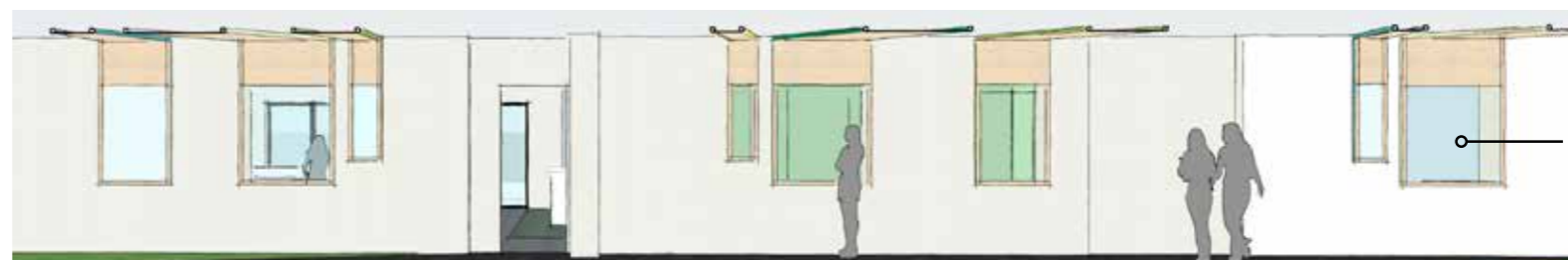
Project Display Boxes along corridor

The King David School is renowned for our innovative programs in the areas of Science Technology Engineering and Mathematics (STEM) education. Our current Building Program has allowed us to redesign all of our learning environments to meet the needs of 21st century learning spaces. Amongst these spaces, we are fortunate to have a dedicated Science and Technology Centre in our new Secondary School at the Orrong Road Campus. In addition to state-of-the-art Science Laboratories, this Centre will provide a much needed home for our world class Robotics Program.