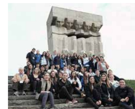
Plaszow Labour Camp