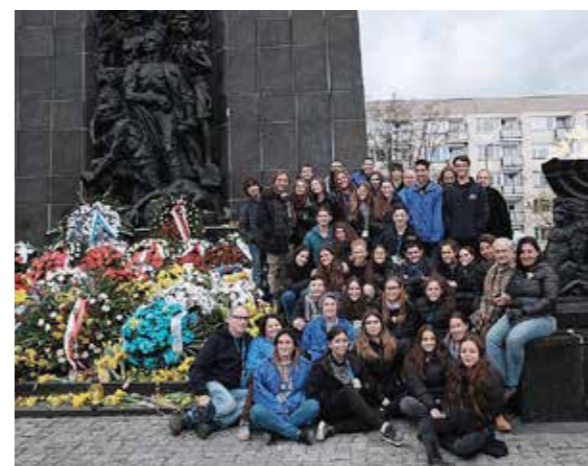
Warsaw Uprising Memorial