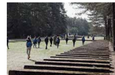
Treblinka Extermination Camp